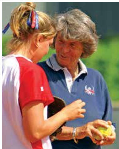
Women’s softball coach at Florida Atlantic University.

Many consider her as “The Greatest Woman Athlete of All Time.” Her jaw-dropping achievements/honors take pages to list, including 20 Hall of Fame inductions, Connecticut Athlete of the Year (selected by the Connecticut Sports Writers Alliance), and a softball field renamed Joan Joyce Field (a part of Municipal Stadium in Waterbury).